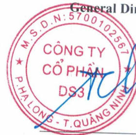
Dao Vu Chinh