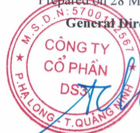
Dao Vu Chinh