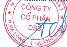
Dao Vu Chinh